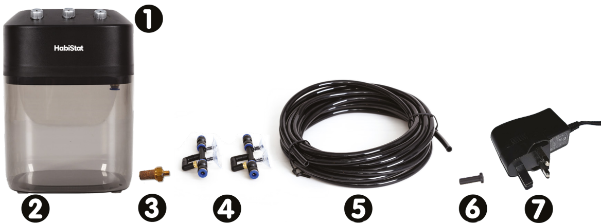
1 Main Unit

Extra or Replacement Nozzle set - HabiStat Rainmaker Nozzle Set (4x Pack) (HSRMNS)